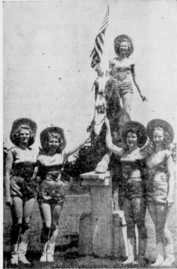
The Tuckerettes are shown above in one of the acrobatic stunts that they will present at the Nyssa night rodeo July 23 and 24.

The co-operation of the farmers and city folks again demonstrates what can be accomplished through mutual assistance. The co-operation in another circumstance in a long list of accomplishments that have always been successful when Nyssa residents and their farmer-neighbors have worked together. Every event in which Nyssa farmers and townspeople have worked together in the last few years has been successful. That is an outstanding record that we hope will be duplicated many times in the future.