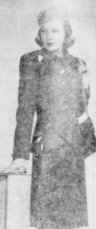
Dark tailored suit for school or business can be made at home at small cost, freeing extra dollars to invest in Security Bonds. Suit patterns procurable at local stores.

After the close of the membership campaign, the local committee will choose the artists for the coming season from a list that includes virtually all the major concert groups, singers, and instrumentalists now before the public, the president said.