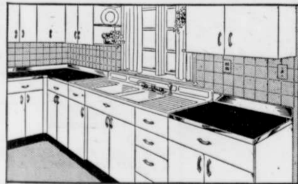
... change it to a gleaming modern beauty.