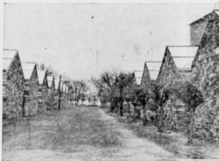
Alongside a spur track of Union Pacific in Yakima, Wash., lies America's strangest village, "Boxville". Comprised of row upon row of tall and long buildings, "Boxville" doesn't provide shelter for a single inhabitant. Its "houses" are composed of tremendous stacks of apple boxes used in harvesting and shipping the multi-million dollar apple crop of the state of Washington. Because Yakima's warehouses couldn't begin to hold the millions of boxes, they are stacked when not in use to simulate houses as in the picture above. Roofs are added as protection against wind and rain.