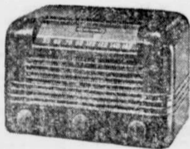
Table models; 5 and 6 tube sets. Also short wave sets. Automatic volume control, built-in antenna. Beautiful cabinets.