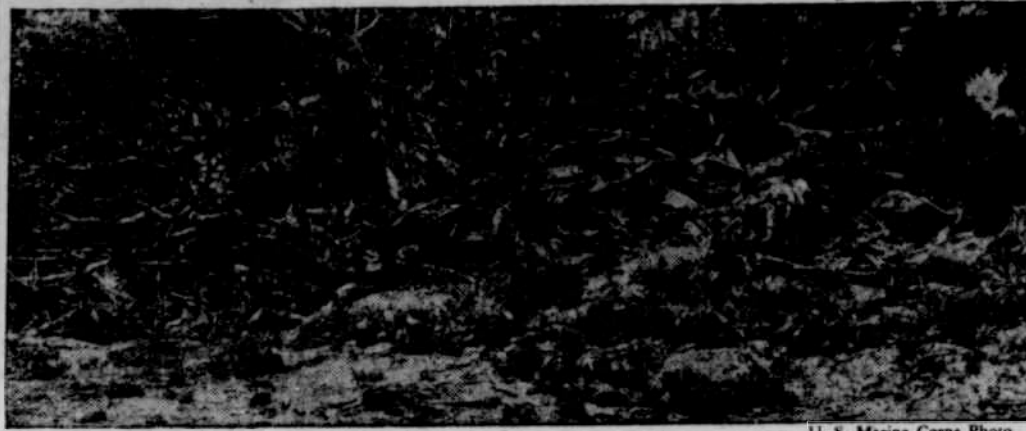
Taking part in rigorous maneuvers at a Marine Corps base somewhere in the South Pacific, several well-hidden Marines demonstrate points they've learned in the art of camouflage. There are at least ten Marines in this picture. Can you locate them?