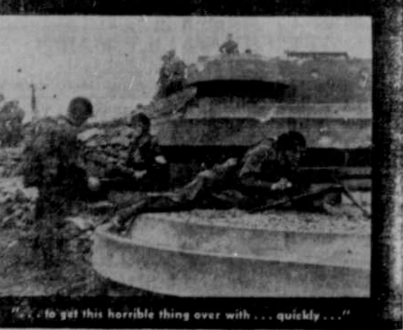
"... to get this horrible thing over with... quickly..."