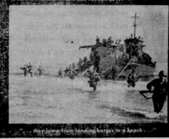
"... they jump from landing barges to a beach..."