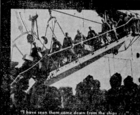
"I have seen them come down from the ships..."