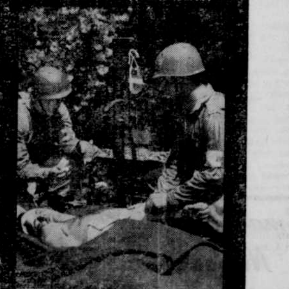
"... the destruction steel and fire can do..."