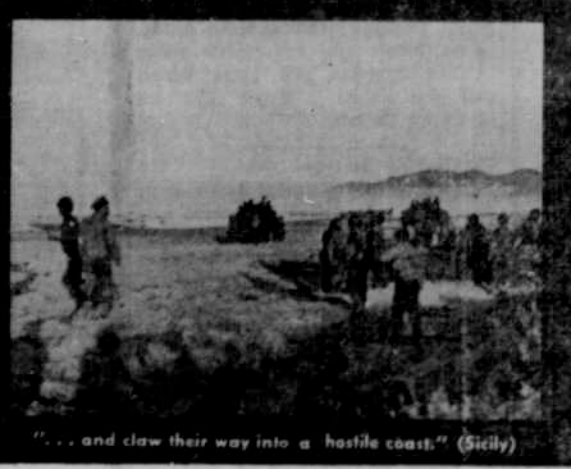
"... and claw their way into a hostile coast." (Sicily)