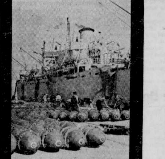
"I have seen the supplies come in..."