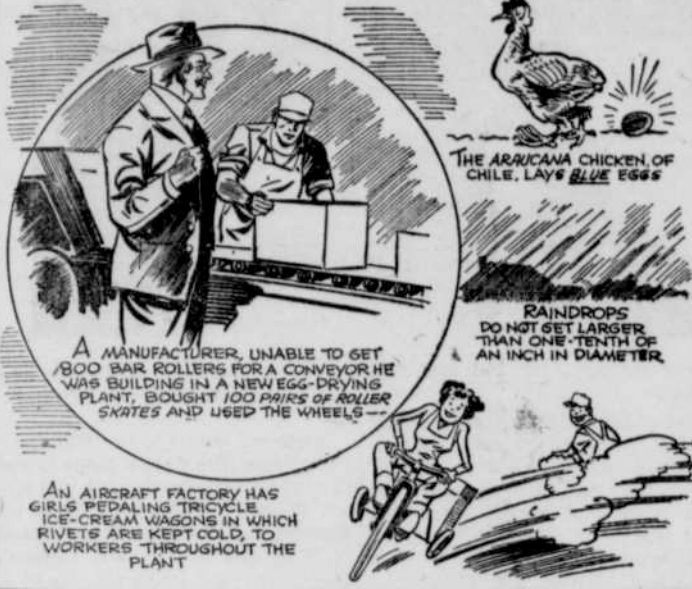
A MANUFACTURER, UNABLE TO GET 1000 BAR ROLLERS FOR A CONVEYOR HE WAS BUILDING IN A NEW EGG-DRYING PLANT, BOUGHT 100 PAIRS OF ROLLER SKATES AND USED THE WHEELS.