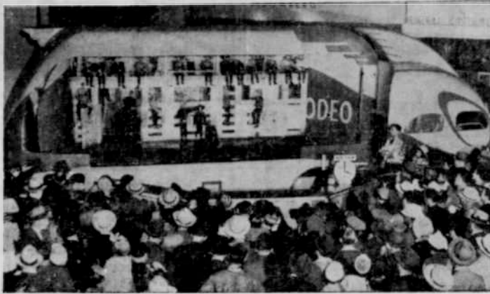
Levi Strauss Puppet Rodeo brought to town through efforts of local Merchant

Levi's Electric Puppet Rodeo, enjoyed by millions of visitors to the 1939 and 1940 Golden Gate International Exposition, will perform here all day Friday, August 29, according to the Golden Rule Store, who was instrumental in bringing this spectacle to town. The exhibit, credited with being the most complex mechanical and sound display ever built, is traveling aboard its monster, streamlined truck. The show is a complete Western Rodeo, and even a clown and his trickmule.