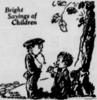
Bright Sayings of Children

A play, "Loves Gift" will be a part of the program and members are asked to bring their favorite recipes for a recipe sale.