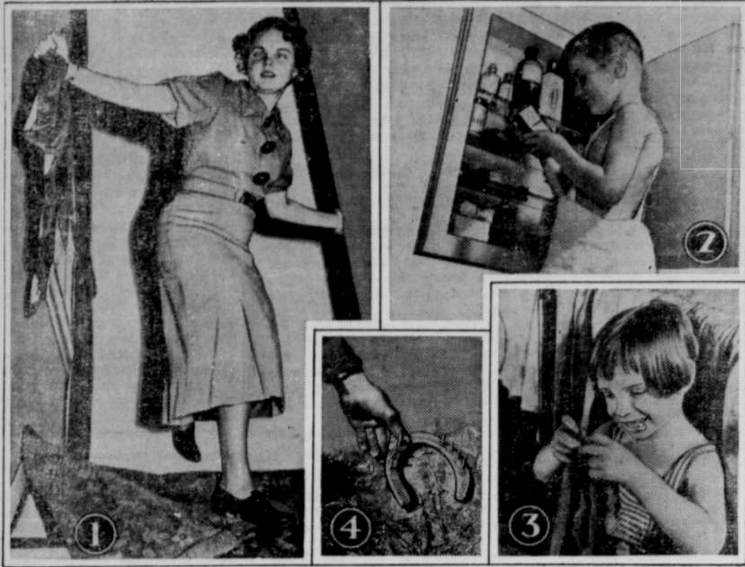
1. Loose rug at top of stairs is a dangerous hazard. 2. Keep medicine cabinets locked or out of reach of youngsters. 3. Teach children not to put safety pins or other small objects in their mouths. 4. Good luck if you hang it up, but bad luck if you step on the nails in this horseshoe.

DURING the month of October, the American Red Cross will carry a safety message into ten million homes and farms throughout the nation, urging a check-up on accident hazards. Do you know these hazards? How safe are you at home? Do you know that deaths from injuries on the farm are steadily increasing? What are the causes? These are a few of the questions the Home and Farm Accident Prevention Service of the Red Cross will send into homes, on an accident check list to be distrib-