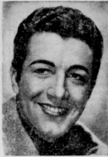
ROBERT TAYLOR as he appears in "THE BROADWAY MELODY OF '938" with Eleanor Powell, Mid. Sat-Sun-Mon-Tues, December 5, 6, 7 at New Pix Theatre in Ontario.