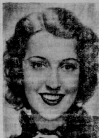
Jeanette McDonald in the "FIRE-FLY". Mid. Sat. Sunday-Monday-Tuesday, November 21-22-23 at the New Pix in Ontario.

If a neighbor's dog or animal offends you, do not make the animal suffer in this cruel fashion for something that is really not its fault but speak to its owner or take the proper course through the law to have it declared a nuisance and let it be put to death painlessly.