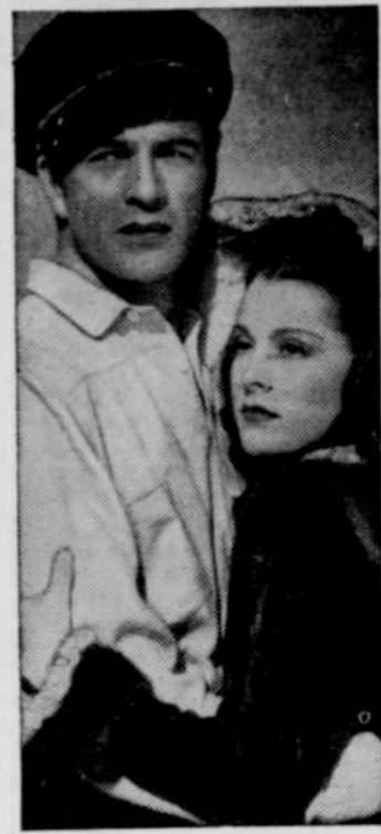
Gary Cooper and Frances Dee in a dramatic moment from "Souls at Sea," which, with George Raft, opens next Sunday at the PIX Theatre in Ontario.