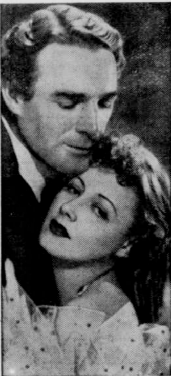
Handsome Randolph Scott and lovely Irene Dunne carry the romantic roles in creditable fashion in "High, Wide and Handsome," Oscar Hammerstein's story of America during the oil boom days set to music by Jerome Kern, which opens Sunday at the PIX Theatre in Ontario.