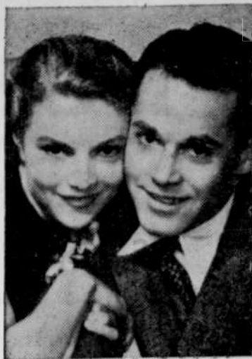
Annabella and Henry Fonda (above) are starred with Leslie Banks in the Twentieth Century-Fox release in natural Technicolor "Wings of the Morning," playing at the Roxy Theatre, Ontario, Sat. Midnight, Sun-Mon-Tues.