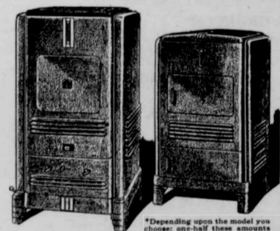
*Depending upon the model you choose, one-half these amounts if hard coal is furnished.

Remember, there's no other offer to compare with this, because no other heater can compare with the genuine Estate Heatrola—the original cabinet heater. Beautiful, modern, all-porcelain cabinets—eight models to choose from. Jointless ash box. Estalloy double-life fire pot. Ped-a-Lever Feed Door. And the wonderful Intensi-Fire Air Duct—Heatrola's famous, exclusive feature that turns waste into warmth, cuts fuel bills 25 to 40%.