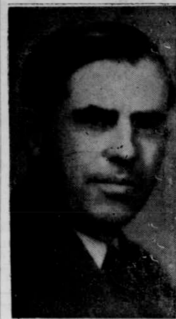
HENRY A. WALLACE Secretary of Agriculture