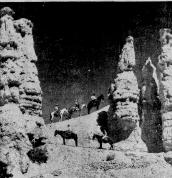
WEIRD AND WONDERFUL. A fairylad in vivid colorings best describes the spectacle of Bryce Canyon National Park in southern Utah. Bryce is a huge bowl-shaped canyon filled with countless rock formations tinted in every shade of the rainbow. This is one of the most unusual of our national parks.