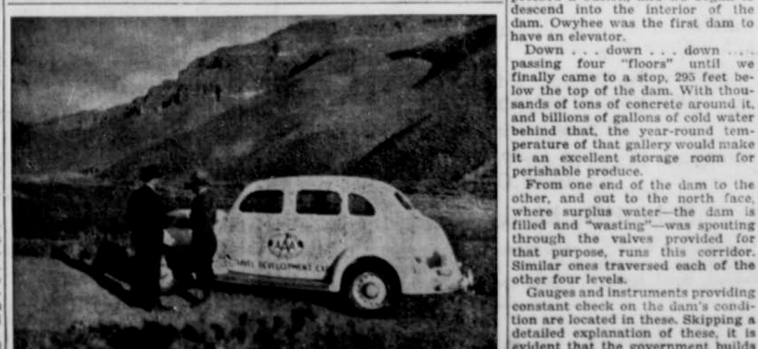
The motorlog car along the Owyhee river

Left Town Friday The motorlog car left Portland early Friday morning and reached Ontario in time for dinner the same evening.