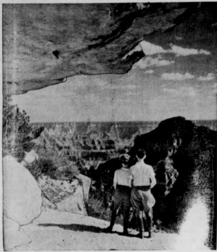
The Grand Canyon is always described as the world's greatest spectacle by the thousands who visit it each year. There is nothing in the world which approaches it in form, size and color. From Bright Angel Point on the North Rim, the canyon is thirteen miles across and has an average depth of a mile. Grand Canyon was made a national park in 1919.