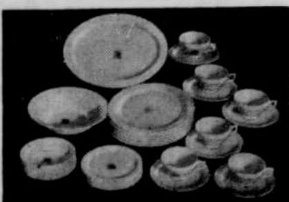
Six colors make up this RAINBOW set, product of Vernon Pottery, Ltd.

WITH 18 GLASSES TO MATCH! 32 Pieces of Dinnerware. Complete Service for SIX. 18 Glasses, 6 each for water, cocktails, beverages. Creamer and sugar bowl also included