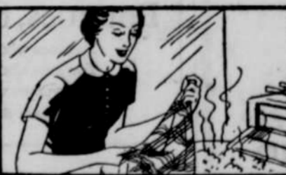
Monday's Wash Goes Faster