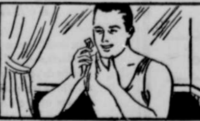
Tough Whiskers Soften