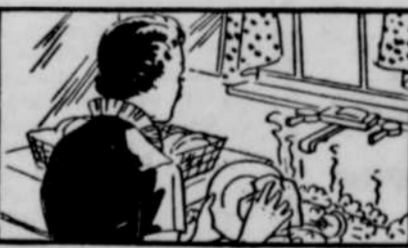
Dishes Wash Themselves