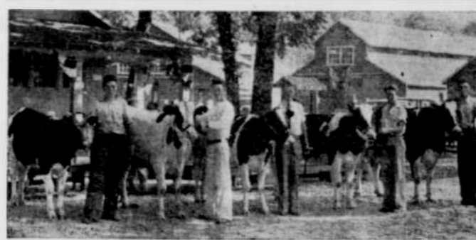
Four-H boys and girls of Oregon will fill to the crowding point four livestock barns at the Diamond Jubilee Oregon State Fair in Salem, September 7 to 13. Above is the 4-H Holstein blue ribbon herd shown by Union county club members at the 1935 fair, when 731 4-H animals were exhibited.