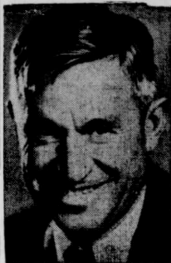
Fox Film's comedy champion is starred in "Steamboat Round the Bend," at the ROXY THEATRE in Ontario—6 days Starting Sunday, September 8.

Tell our Advertisers you saw their ad in the Journal