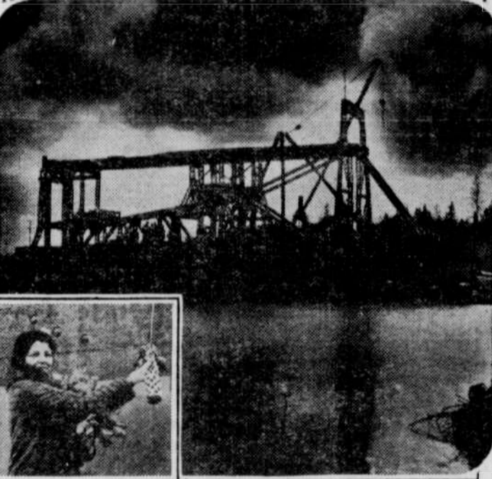
Dredge Boat Near Sumpter

It's Gold! No matter how, by dredge, pick or mill, it remains eastern Oregon's most important industry to be celebrated with the Baker Mining Jubilee July 3-4.