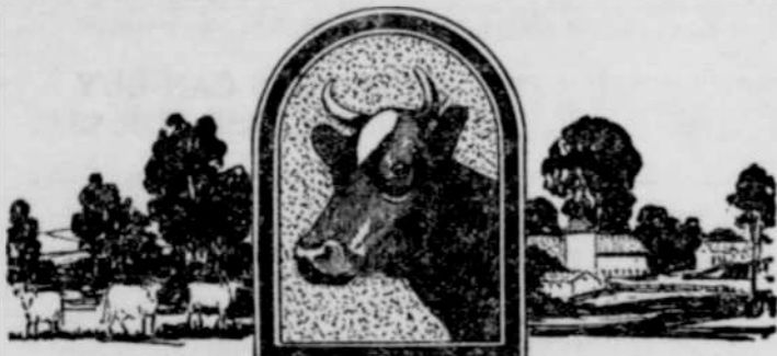
the School Child

should have all the clean, wholesome milk he can drink. Plenty of milk is a body builder and makes your boy and girl better able to resist the various ailments which continually threaten the child.