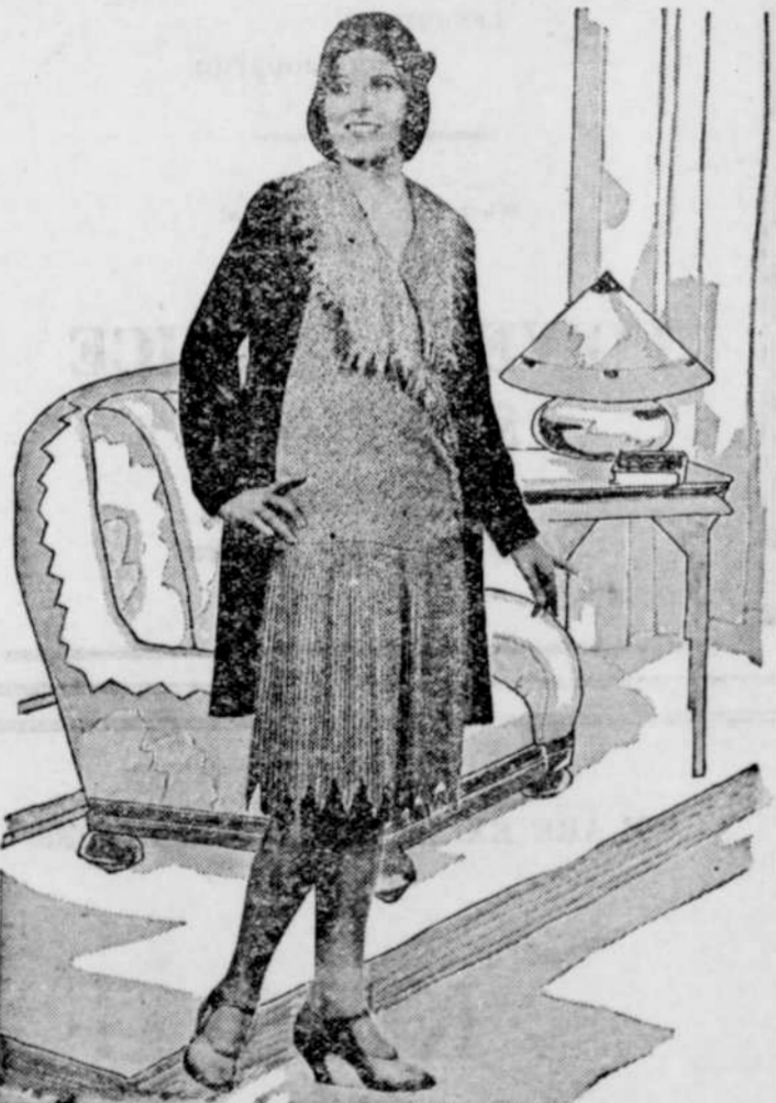
Velvet Coat Topping Print Frock.

There is no more winsome combination booked for spring than that of