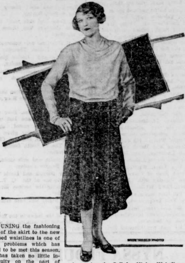
Answering the Call for Higher Waistlines.

T UNING the fashioning of the skirt to the new raised waistlines is one of the problems which has had to be met this season. It has taken no little ingenuity on the part of dress designers to create skirts which conform to the new tuck-in blouse types without sacrificing slenderized hips.