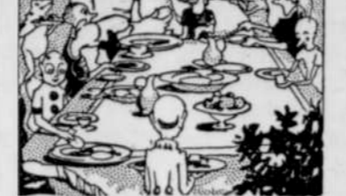
Was a Huge Success.