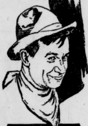
Another "Bull" Durham advertisement by Will Rogers, Zigfield Follet and screen star, and leading American humorist. More coming. Watch for them.