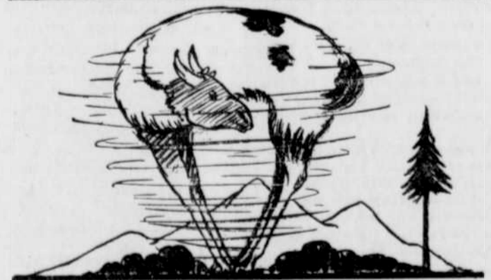
THE GYRATING LLAMAKIN

The Gyrrating Llamakin is a beast so very thin He can hide behind a slender clothesline pole; His skin is knitted wool, which is fitted smooth and full, And his eyes are big and black like lumps of coal. His tail is short and stunted, while his horns are flat and blunted, And he dances like a windmill in a gale, 'Round he twirls so rapidly it would fill your heart with glee, For he always seems to want to catch his tail. This beast, he sleeps a lot, but he doesn't need a cot, For he just winds himself up in a twist, Then he looks like knitted cloth, 'till you see him amble off. —So we'll add this comic beastie to our list.