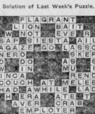
Solution of Last Week's Puzzle.