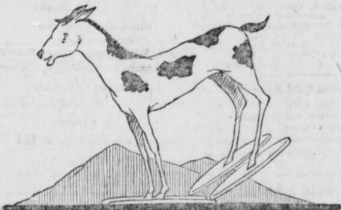
THE TIDDLY-WINK GAZELLE

The Tiddy-Wink Gazelle is a beast with feet of shell, And his feet make click-click noises as they travel; For he snaps himself around, over any sort of ground, Without a stop, hippity-hop, through mud, or sand, or gravel.