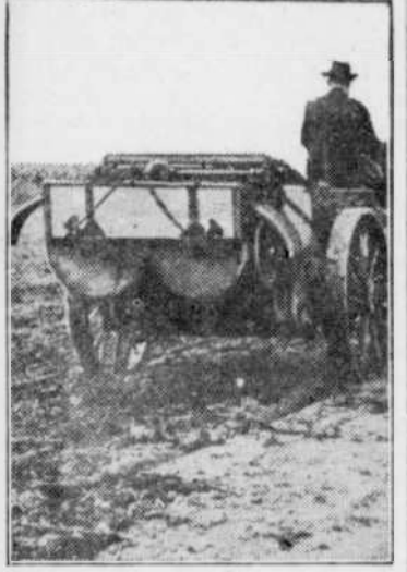
The Proper Way to Apply Manure to the Soil.

If the manure is not available, a liberal application of commercial fertilizers rich in phosphoric acid should