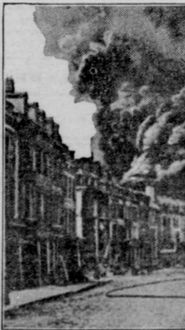
Antwerp Was in Flames.

tants to their town will have to be taken into consideration. It is to be hoped that the burgomaster's plan for the rebuilding of the whole town, including the Cloth hall and the cathedral will not materialize, but nothing will prevent the inhabitants from going back to their old houses and restoring them to the best of their abilities. While regretting, from a purely artistic point of view, that the present ensemble of the grandest pile of ruins created by the war will not be entirely preserved, every Belgian will feel happier to think that, even here, in the most desolate spot of this desolate country, local pride and love of the clock tower proved stronger than the German guns, and that the cock will crow again and children laugh where shells of every description burst ceaselessly for four years amid the clatter of falling debris.—Emile Cammaerts in Yale Review.