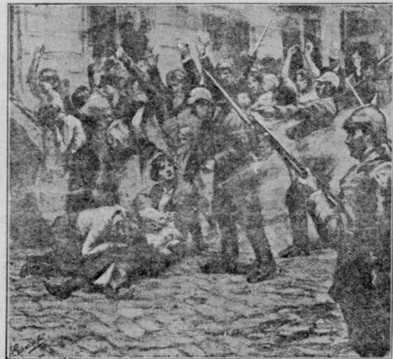
"And Then Those Germans Came."

The case of Ypres is particularly interesting. It had been proposed at one time to preserve the ruins of the whole town in their present state as a war memorial. But the interest of private owners and the attachment of inhab-