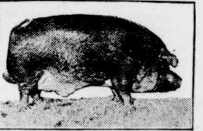
Champion Duroc-Jersey Boar.

Upon arriving at the farm the boar should be unloaded as soon as possible and placed in quarantine to guard against the introduction of disease into the herd. If he is lousy it is well to treat this condition at once. His feed should be a continuation of that to which he has been accustomed, feeding rather lightly the first few days until he recovers from the strain of shipping and becomes accustomed to his new surroundings. If it is not feasible to continue feeding as previously indicated, the change to a more convenient ration should be made very gradually in order not to disturb the appetite or health of the