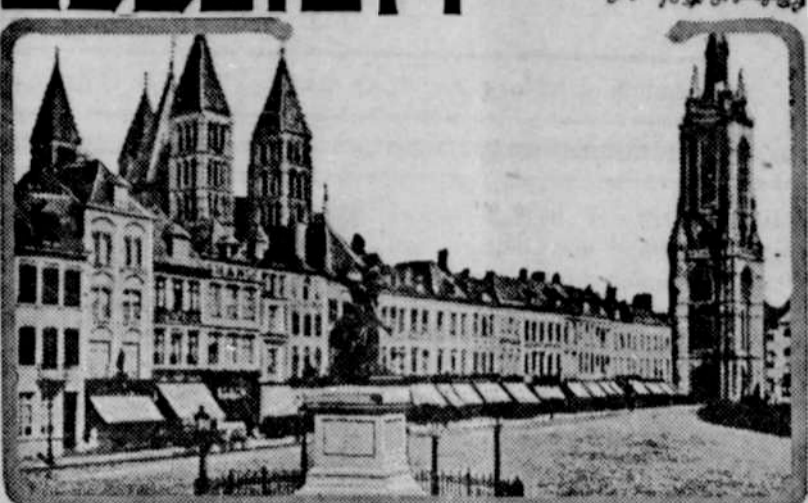
The Grand Place and Cathedral.

T OURNAI, the oldest city in Belgium, on the capital of the Merovingian kings, is truly a city of romance, whether we think of the tomb of Childeric, the father of Clovis, with its wonderful treasures, discovered after being lost to sight for nearly 1,200 years, or of the poor, deluded youth, Perkin Warbeck, the tool of the Yorkists, and through them brought to an ignominious death, says a writer in Sketch.