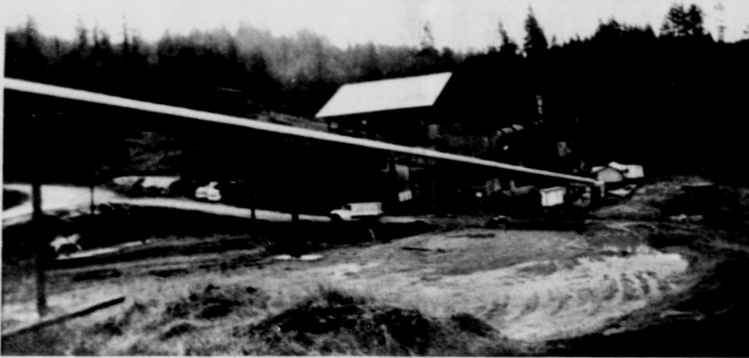
NEW EMPIRE Lite-Rock Inc. plant will be in operation within a short time. The plant, which is constructed to meet both DEQ and economic restrictions, will recycle all residue from

the operation with only steam left to escape into the atmosphere.