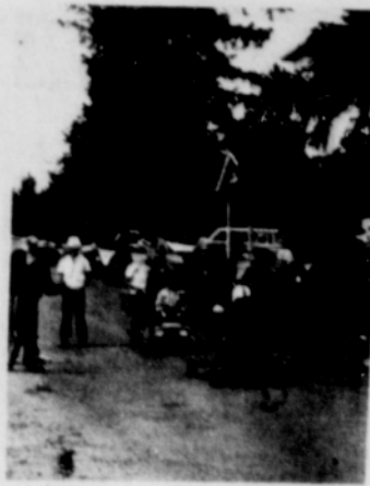
A New Event