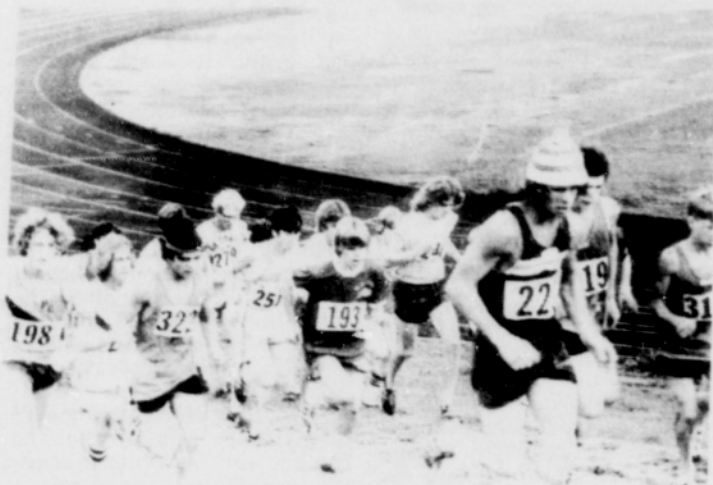
Cross Country At State