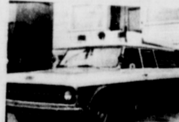
The New Ambulance