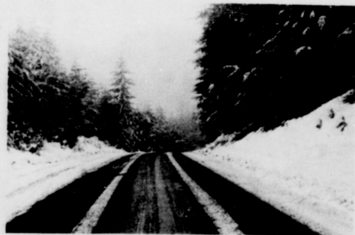
Surprise-Snow November 2