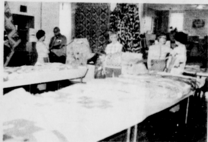
The Quilt Fair