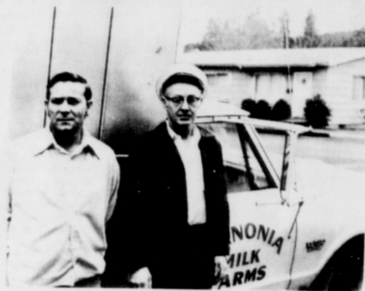
An old business gets new owner