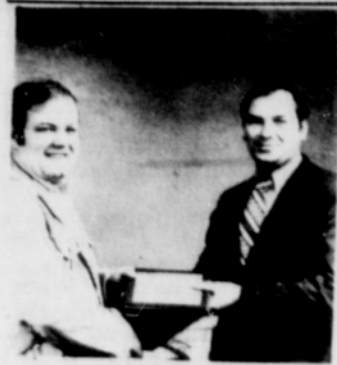
Distinguished Service Award