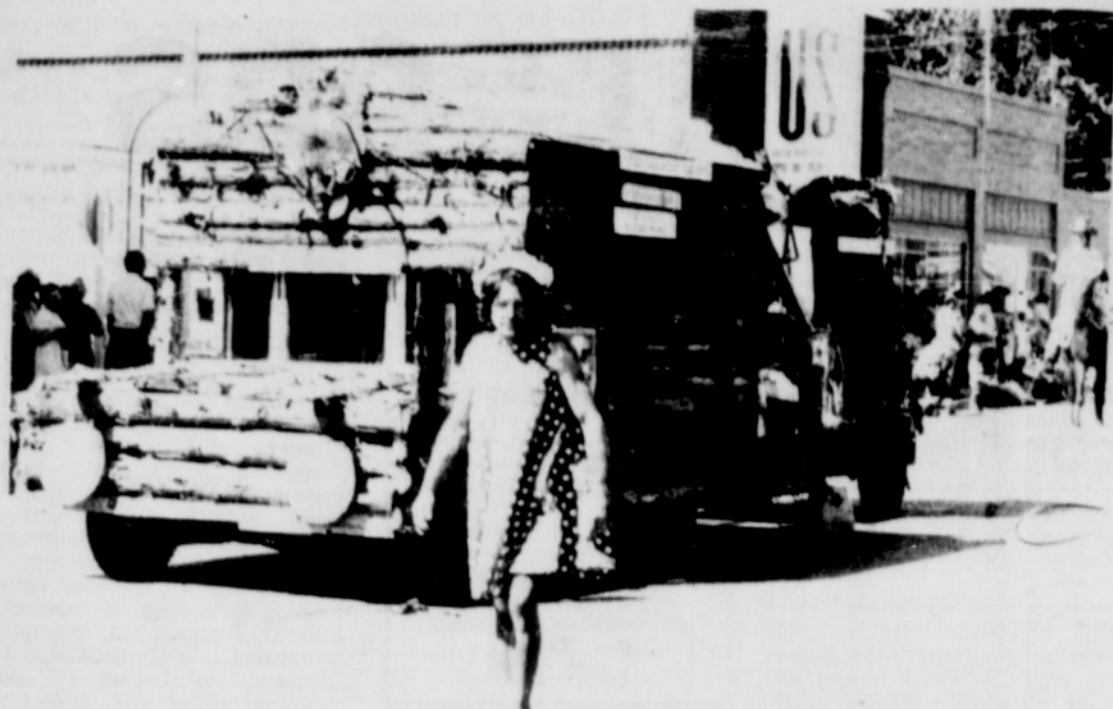
THE 17TH Annual Vernonia Friendship Jamboree brought many out for the parade where they enjoyed viewing entries from all over the area.