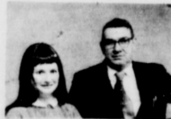
Citizen of the Year