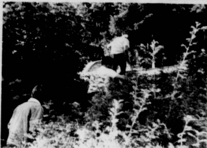
Police Cadets In Action