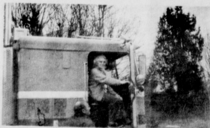
Hitch Hiking Grandma