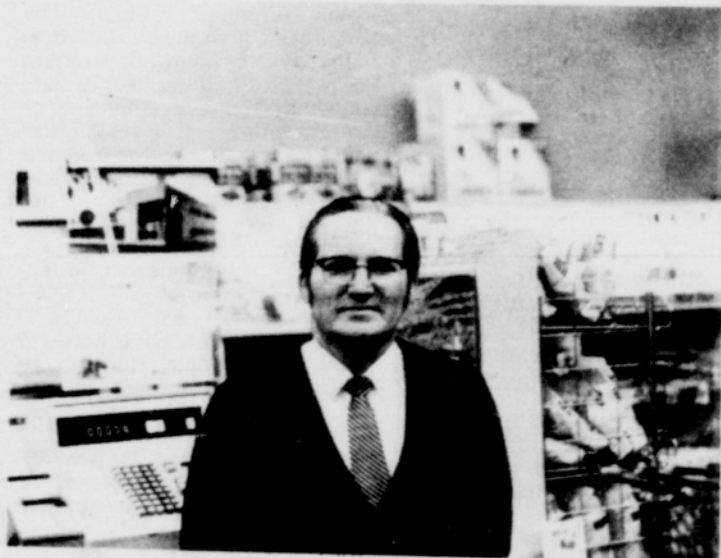
1973 Mystery Santa