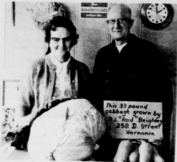
October was good for cabbage