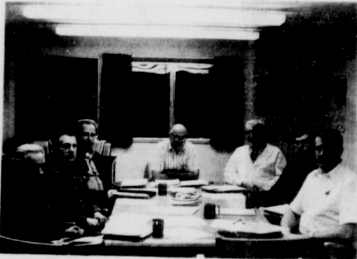
City Council in April