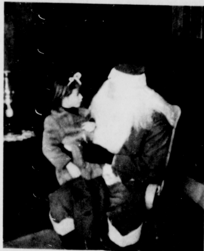
SANTA CLAUS is in Vernonia Saturday, December 15 and Saturday, December 22 to hear requests from all the little boys and girls. He can be seen at Santa Claus Lane in the Quinn building from 10 a.m. to 12 noon and from 1 to 3 p.m.