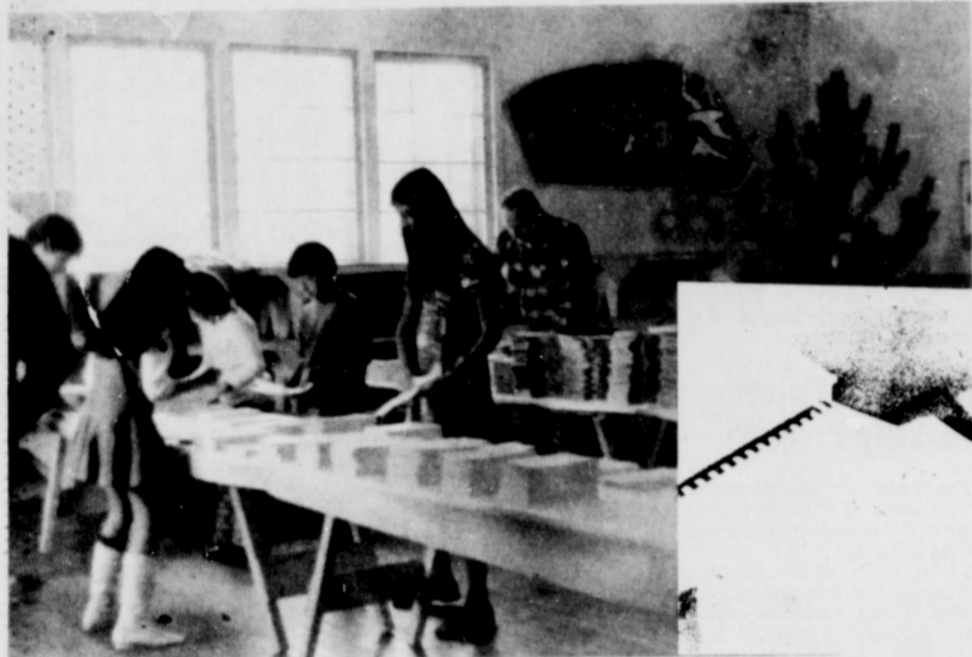
MEMBERS OF St. Mary's Parish work to assemble their cookbooks entitled Lov'n Cookery. 16 from 8 a.m. to 12 noon and 1 p.m. to 5 p.m. Despite delays in receiving equipment, books will be available in Vernonia Sunday, December 16 from 8 a.m. to 12 noon and 1 p.m. to 5 p.m. at Brunman Hardware on Bridge Street.

For value savings, turn to page three of this week's edition of the Vernonia Eagle where there is a complete page showing those merchants who will be open for this special Sunday only sale. Shop Vernonia and save.