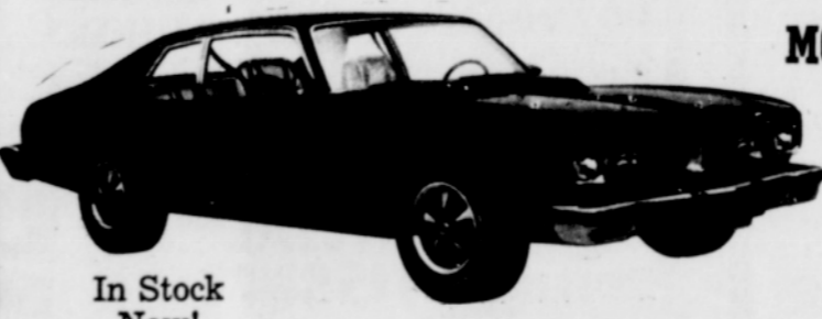
In Stock Now!