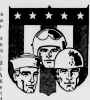
THOSE WHO SERVE

Some of the Boys will be needing 2 cycle engines to work on. Anyone having one who would like to donate it to the boys may contact the school or Mr.