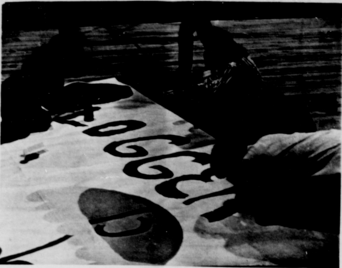
VHS STUDENTS busily decorate signs, posters and walls for the annual 1973 Homecoming Week. Festivities will take place Thursday night followed by the Homecoming game against Knappa on Friday at Greenman Field.

One of these three princesses will be the Homecoming Queen of 1973. Coronation activities will begin at 7:30 p.m. on Thursday, October 25 at VHS.