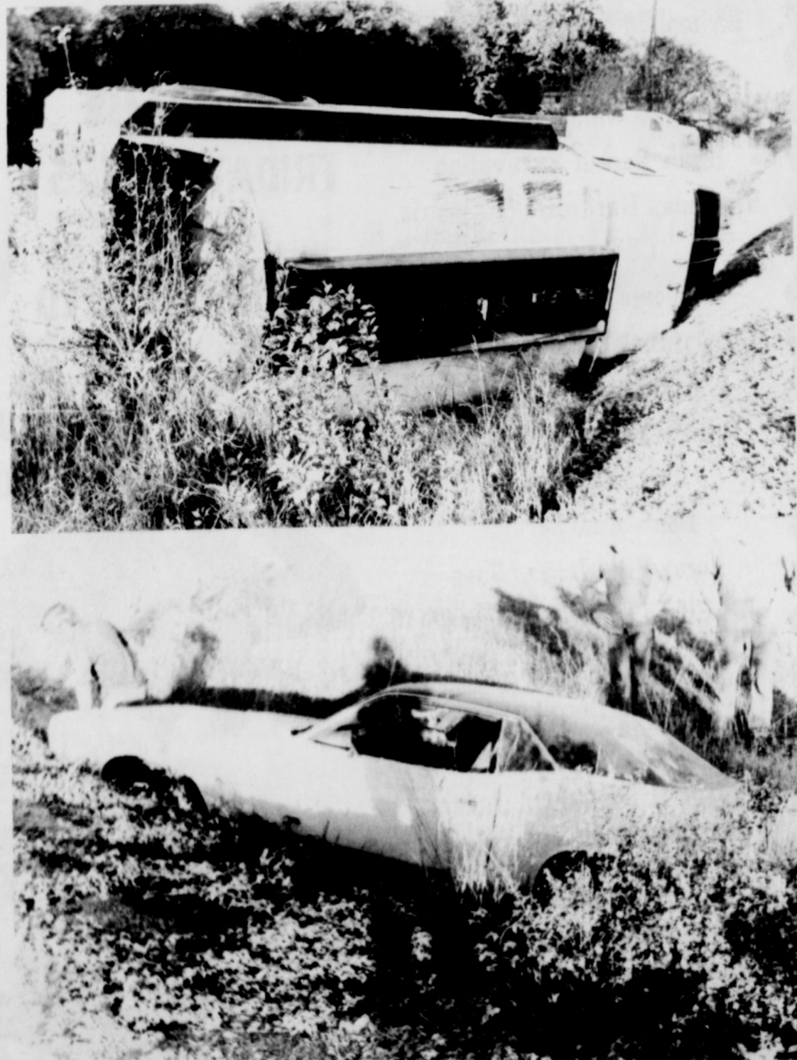
A TWO VEHICLE accident resulted in an oil spill on the road in the Riverview area Tuesday afternoon. No other details were available at ending up in ditches on their respective side press time.