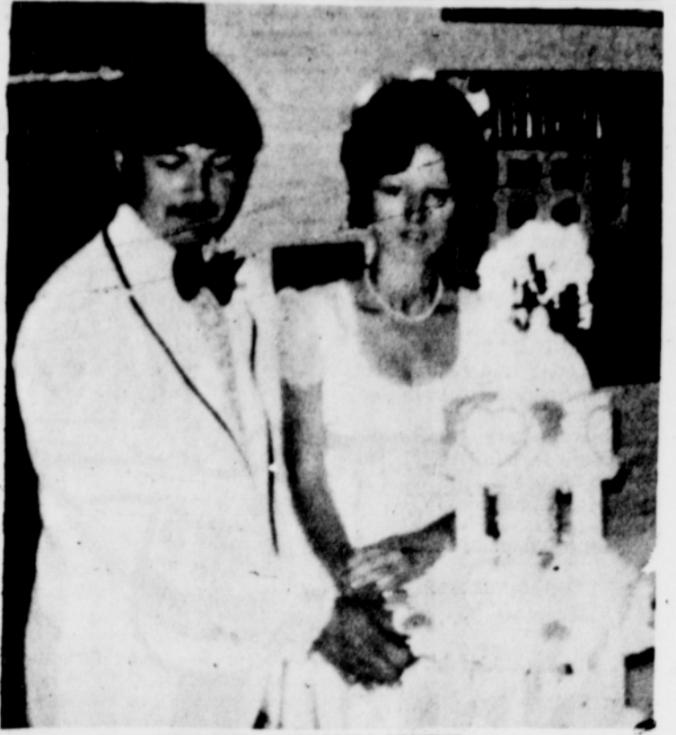
BEASTON - JENNINGS UNITED