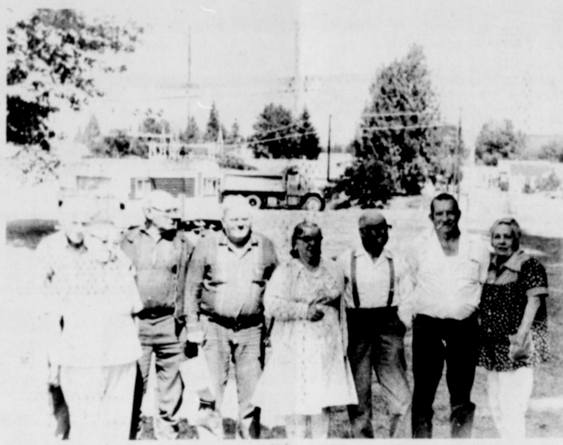
MEMBERS of the local Green Thumb gathered with their wives, at Anderson Park Sunday, August 26 for their third annual picnic marking another successful year of work on local projects.

Our next business meeting and potluck will be Friday, September 7 at 12:30 p.m. All members welcome.