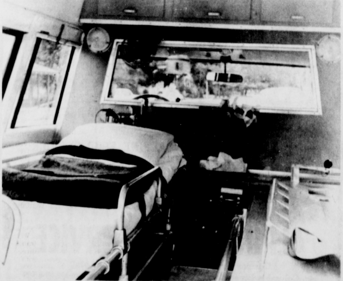
THE NEW Vernonia Trauma unit provides swift space for additional stretchers, and other necessary equipment. The compact vehicle features convenient storage.