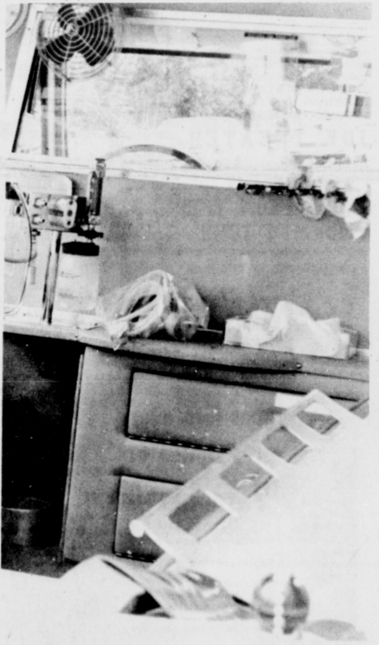
OXYGEN UNIT is readily available to victim who may need it as is other emergency equipment to provide the best in care for those being transported by the trauma unit.