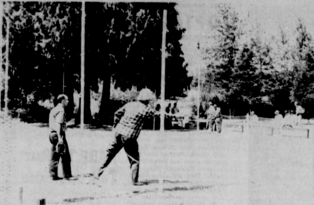
HORSESHOES was the name of the game Saturday as the 2nd annual Nehalem Valley Open Tournament got underway at Hawkins Park.

The event drew several out-of-town contestants as well as many spectators.