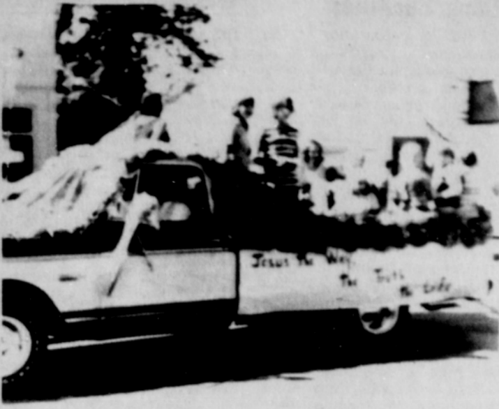
BIBLE CHURCH entry took second place in its division.