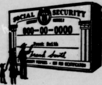
By Woodrow Moe

The Breath of Life Campaign supports not only research, but over 100 C-F Centers for diagnosis and treatment across the country.