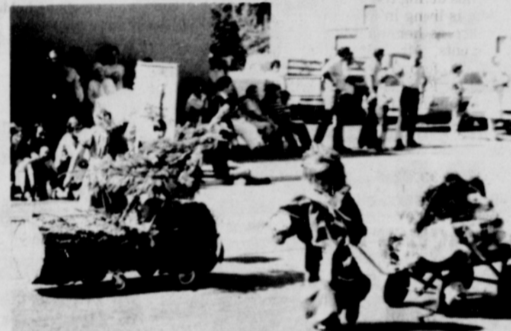
ROCK-A-BY-BABY. This little one rides in a very special buggy member of junior parade, while another tot manfully pulls wagon.