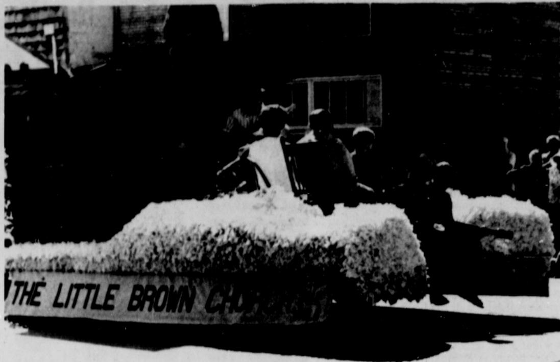
ONE OF THE several gaily decorated floats which were entered in the Jamboree Parade. This one took a first in religious groups classification.