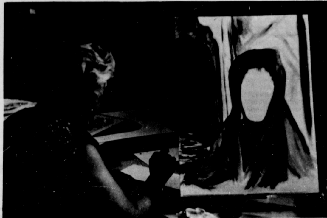
THE ART SHOW, held this year at the Masonic Temple, featured several demonstrations of handcrafts. Among them were leatherwork, pottery, weaving and oil painting as shown above.